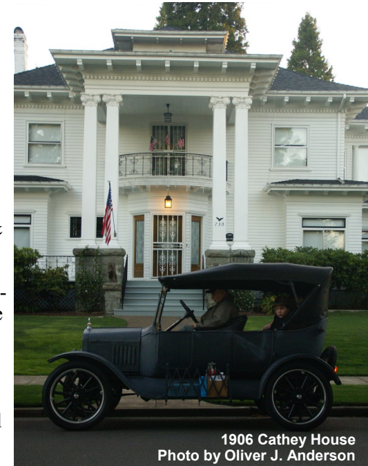
1906 Cathey House