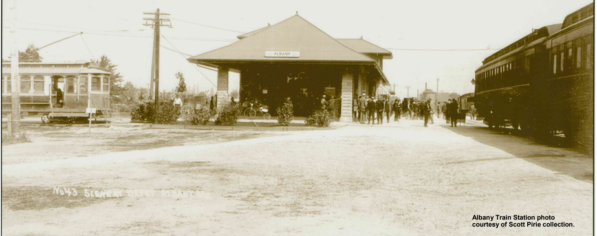
Albany Train Station